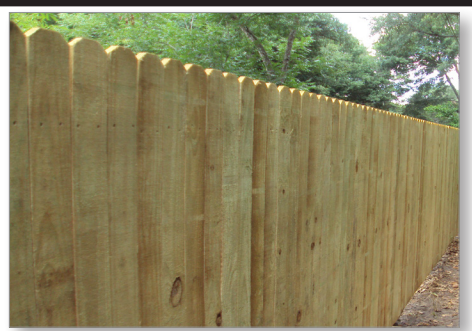
Water Sealed Stockade - 6' Height