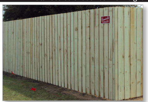
Water Sealed Board on Board - 6' Height