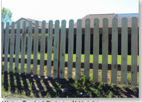
Water Sealed Picket - 4' Height