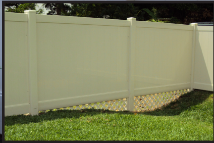
Shown with optional Lattice Filler