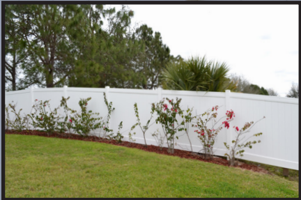
BGM Lakeland Angled with Slope