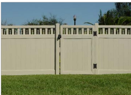
Spirit Lake in almond with optional walk gate and Fleur-de-lis finials