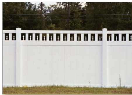
Spirit Lake with optional Fleur-de-lis finials