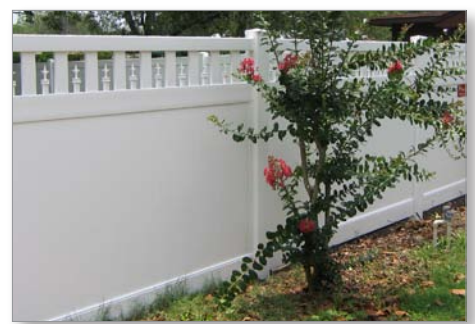
Spirit Lake with optional Fleur-de-lis finials