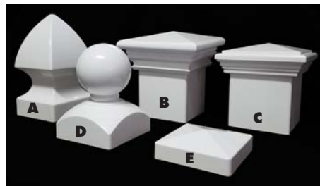
A. Gothic Cap B. Federation Cap C. Classic Cap D. Ball Cap E. Traditional Cap